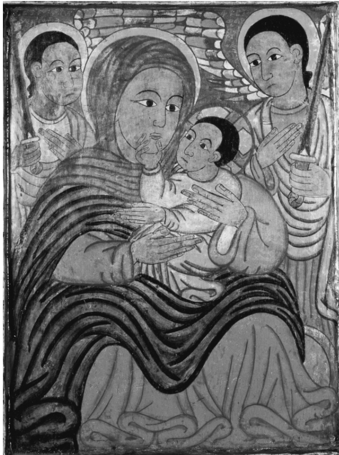
Icon of Jesus and Mary flanked by angels, created in the Tigray region of northern Ethiopia in the late 15 th century.