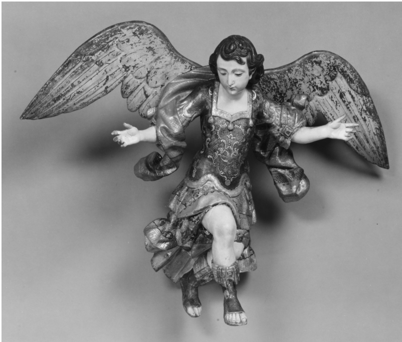
Angel from a nativity scene, carved in 18 th -century Guatemala.