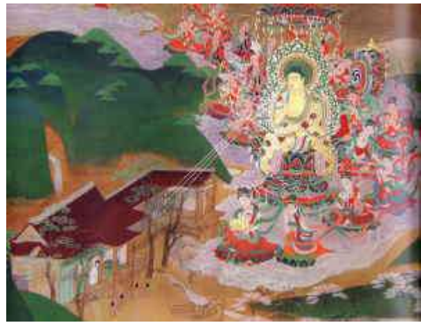
In the frontispiece of "kuhon raigo-zu", the Buddha Amita, accompanied by "Unchu Kuyo Bodhisattva" (Bodhisattva in the cloud of the Pure Land) descends to welcome the dead into the Pure Land.