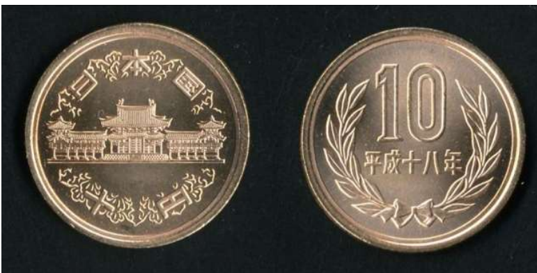
A contemporary Japanese ten-yen coin (¥10) engraved with the Phoenix hall.