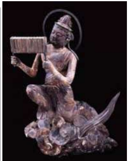
Images of "Unchu Kuyo Bodhisattva" playing old Japanese traditional instruments.