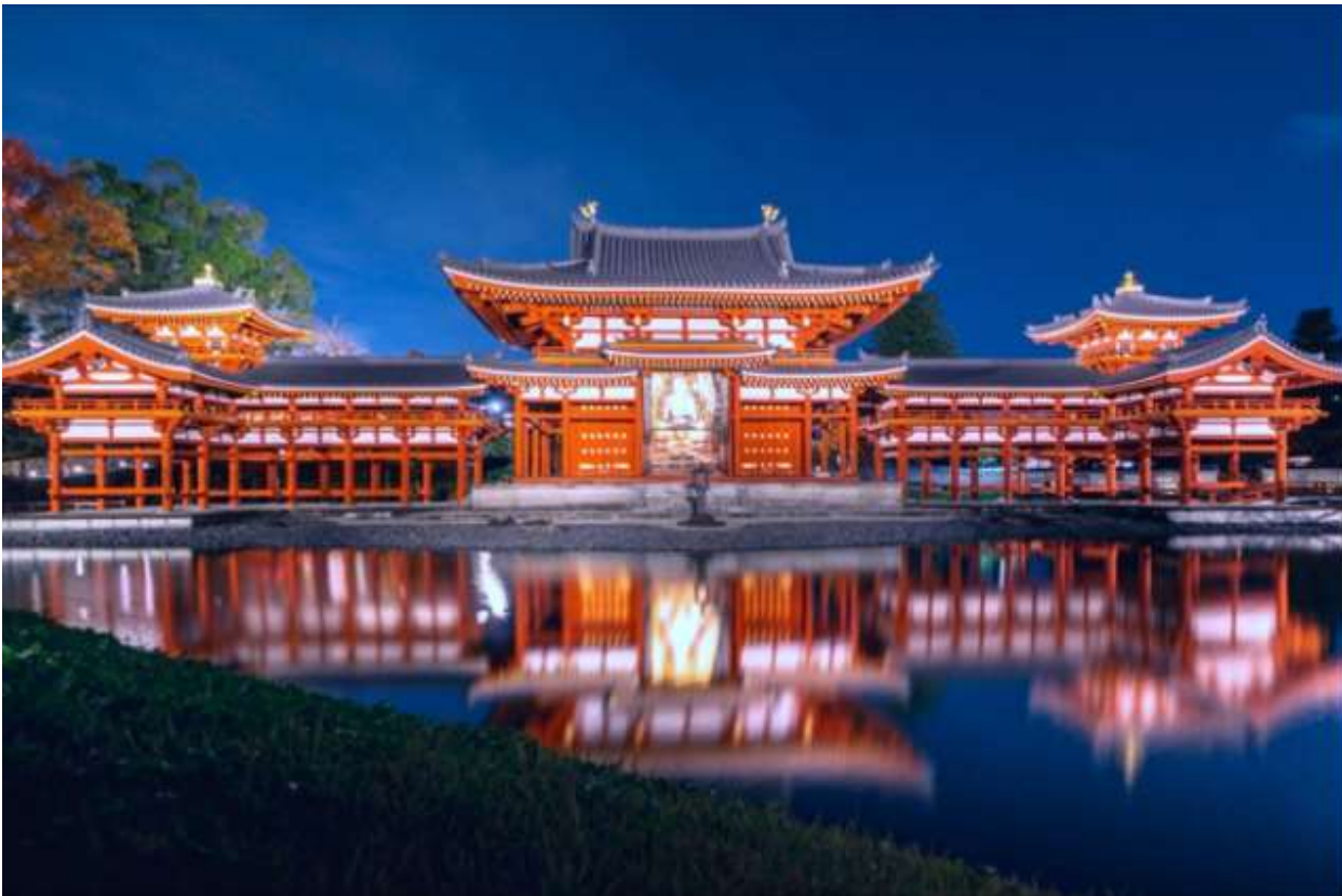
Hōōdo hall (Phoenix hall) of Byodoin Temple of Kyoto

In Hōōdo hall (Phoenix hall) of Byodoin Temple in Kyoto, there is a frontispiece of the “Kuhon Raigo-zu” painted 1,000 years ago. In addition, there are 52 wooden statues of Unchu Kuyo Bodhisattva from the same period. The "Unchu Kuyo Bodhisattva" are playing old traditional Japanese instruments in “Kuhon Raigo-zu”.