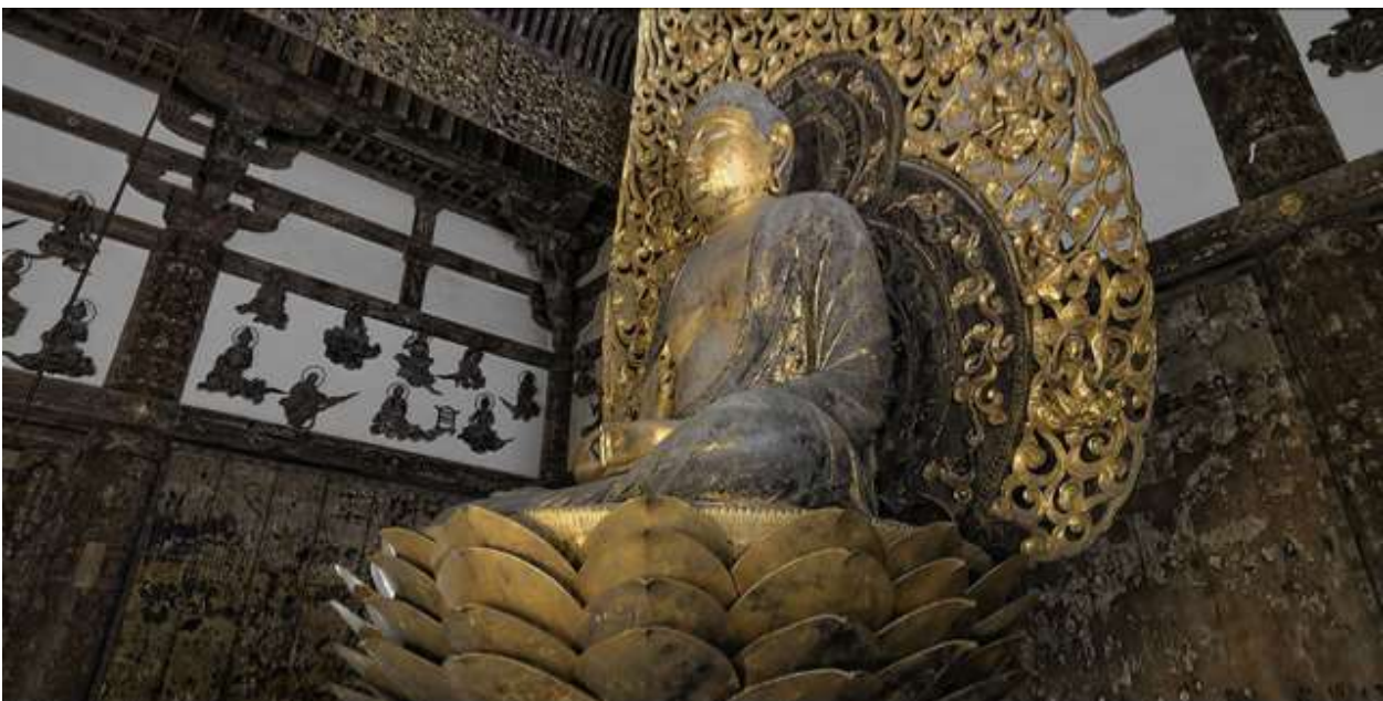
Inside the Hōōdo hall (Phoenix hall) of Byodoin in Kyoto.