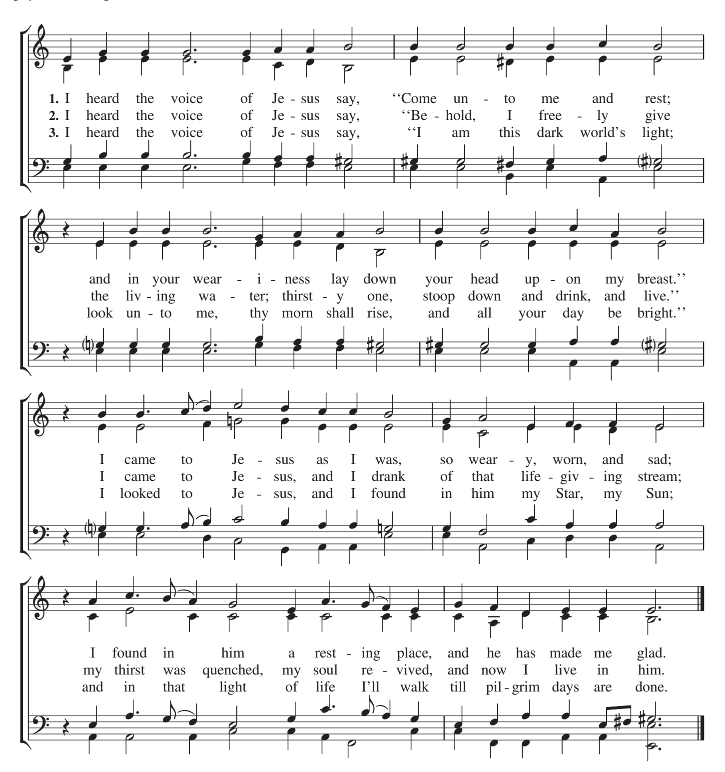
The Hymnal 1982 #692, WORDS: public domain; MUSIC: by permission of Oxford University Press