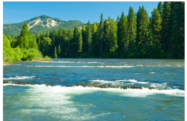
Clockwise from top left: 1) San Juan Island National Monument, A view from Lopez Island. Photo by Jeff Clark for the U.S. Bureau of Land Management, 2014; public domain. 2) Sunset at Sunset Beach, Anacortes, Photo by user Chanilim714 via Wikimedia Commons, (CC BY-SA 3.0). 3) Rapids on the Wenatchee River. Photo by the U.S. Forest Service—Pacific Northwest Region, 2008; public domain.