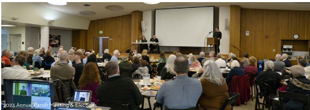
2023 Annual Parish Meeting &amp; Elections