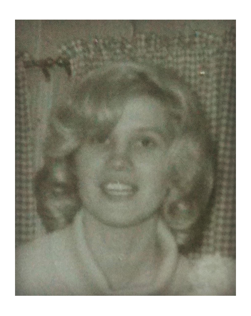
January 12, 2024 12:00 PM