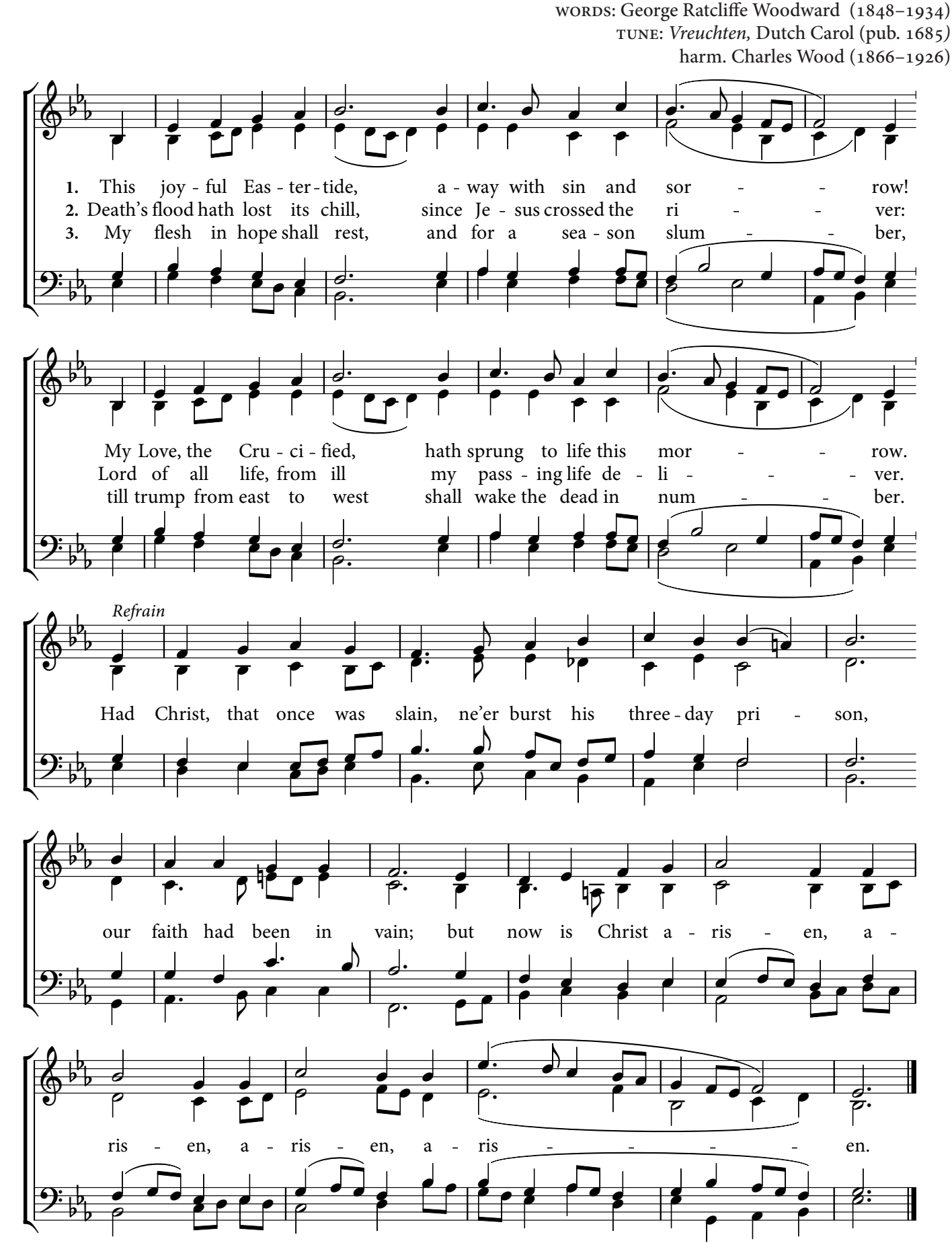
The Hymnal 1982 #192; words: by permission of A.R Mowbray & Co. Ltd., from The Cowley Carol Book; music: public domain.