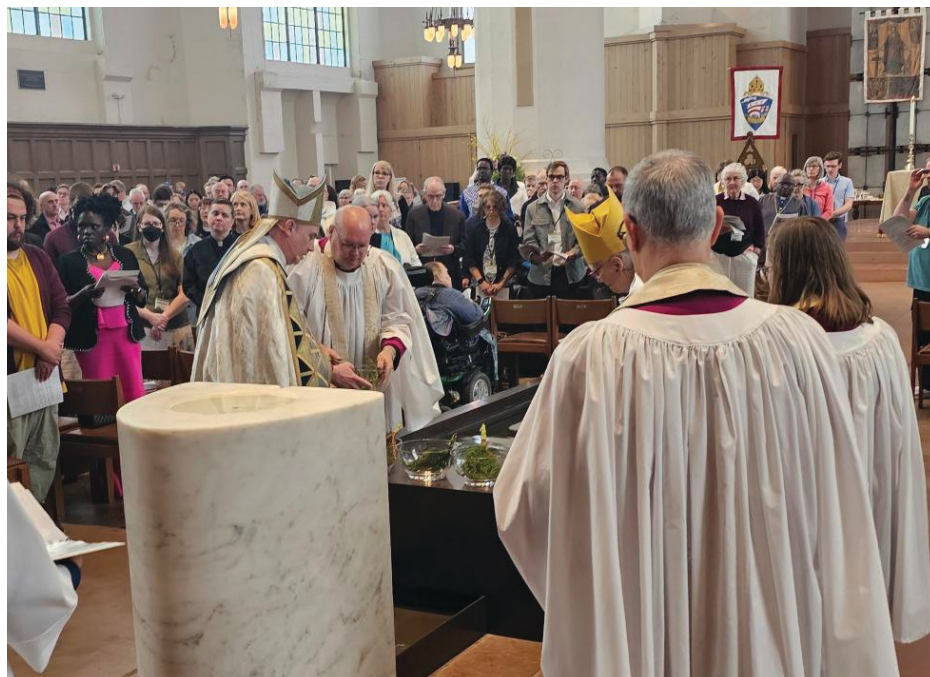
photo from Cathedral Day 2025