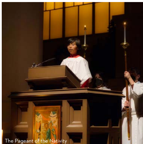
The Pageant of the Nativity