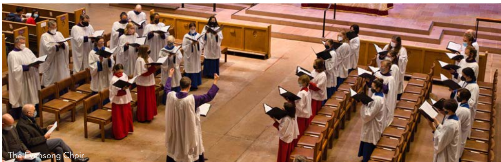
The Evensong Choir