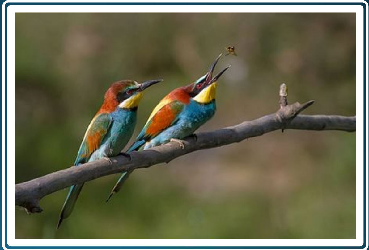
European Bee Eater, on migration