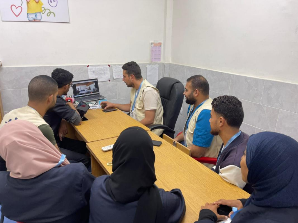
Team in Gaza