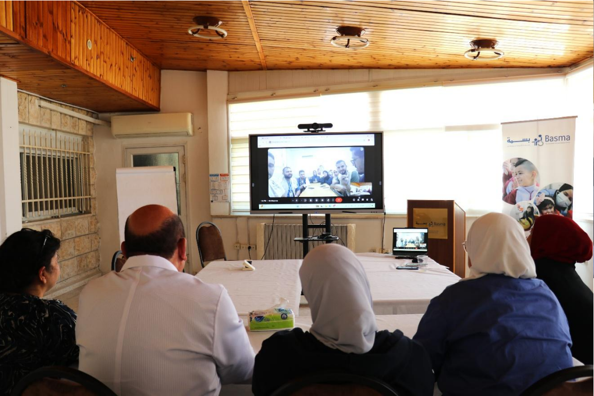
Team in Jerusalem